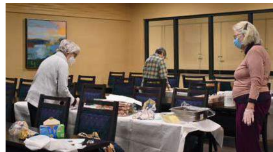
Independent living resident volunteers

The Village at Rockville’s ConnectedLiving team along with independent living residents kicked off a monthly program to benefit women in need in the Rockville area. Each year, in honor of Dr. Martin Luther King, Jr.’s birthday and the MLK Day of Service, The Village at Rockville creates an opportunity to give back to the local community. This year, team member and resident volunteers created 70 lunches for the Interfaith Works Women’s Shelter in Rockville. Due to the increased need for support during the pandemic, the group will supply lunches in subsequent months in 2021. We are thankful for all of our volunteers who adhered to guidelines for social distancing to create these meals for those who live at the Interfaith Works Women’s Shelter. We feel so blessed to have the opportunity to serve this worthwhile organization in our greater community.