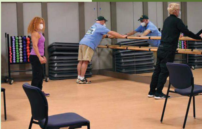
Residents enjoying a fitness class in the Engage Center in Glenmere

evolve and thrive. It is wonderful to have the Engage Center stand as a hub for wellness and engagement for residents." While the Engage Center is open on a limited basis due to COVID-19 and Maryland Department of Health guidelines, wellness programs are being held in the Strength and Cardio Center, the Learning Center and the Creative Art Studio.